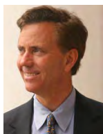
Ned Lamont (D)